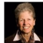
October 24 Dr. Joan Steitz, Yale University (Hosted by the Genetics Graduate Students)