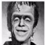
October 31 Genetics Program Halloween Party Dr. Victor Frankenstein, University of Transylvania (Hosted by the Ghouls and witches of the Genetics Program)