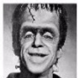
October 31 Genetics Program Halloween Party Dr. Victor Frankenstein, University of Transylvania (Hosted by the Ghouls and witches of the Genetics Program)