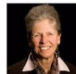
October 24 Dr. Joan Steitz, Yale University (Hosted by the Genetics Graduate Students)