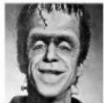
October 31 Genetics Program Halloween Party Dr. Victor Frankenstein, University of Transylvania (Hosted by the Ghouls and witches of the Genetics Program)